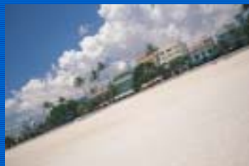
Scenes of Florida