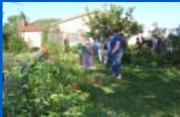
Next it's on to Colette Peel's