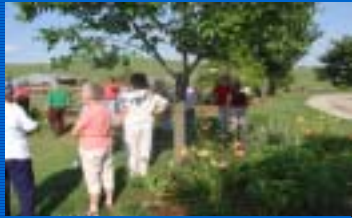
Garden Tour First Stop at Jean Riley's