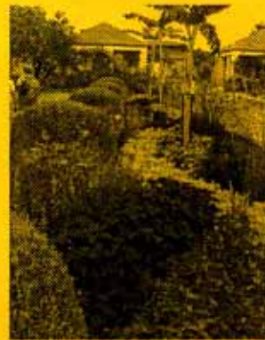
Ewing & Muriel Kauffman Memorial Garden

37 acres surround the Kauffman Legacy Foundation which includes the Memorial Gardens and the Discovery Center which is a ten acre track of gardens, wetlands, walkways and wildlife and an environmentally friendly building which houses the Mo. Dept of Conservation & the Mo. Dept. of Nat. Resources.