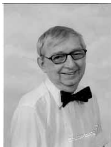
The 2006 President's Farewell Message