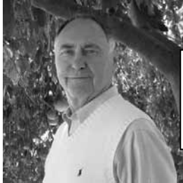
The President's Message

HAPPY NEW YEARS TO ALL FROM TGOA/MGCA HEADQUARTERS