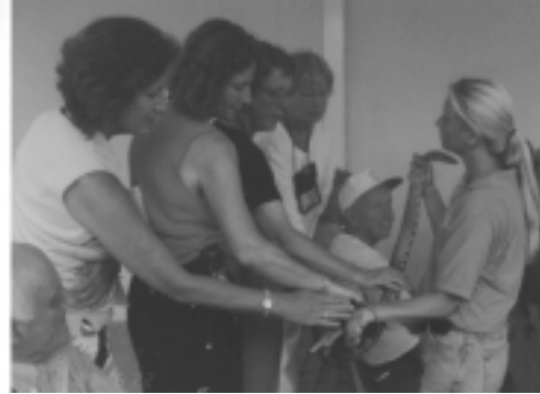
That is a snake they are petting