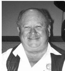
The 2008 President's Message