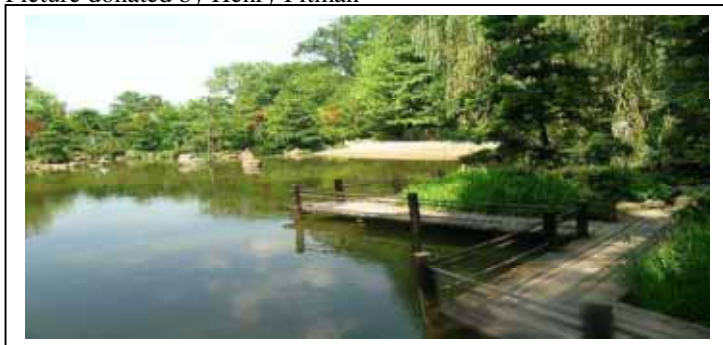
Anderson Japanese Garden tour

I had the pleasure of attending the 2007 TGOA/MGCA National Conference held in Rockford, Illinois and saw first hand the community wide pride in the beautification of the city, which lends itself to the “small-town feel.” This was an appropriate setting for the conference as many members from all over the country met up to share stories, tips and advice on the many aspects of gardening in their communities, as well as simply reconnecting with friends. Community beautification and education drove this symposium with knowledgeable speakers and amazing tours. I had the pleasure of meeting many wonderful people who shared their stories with me and welcomed me into their circle. Thank you TGOA/MGCA for having me. I look forward to next year in Fort Wayne, Indiana (especially the carrots ☺).