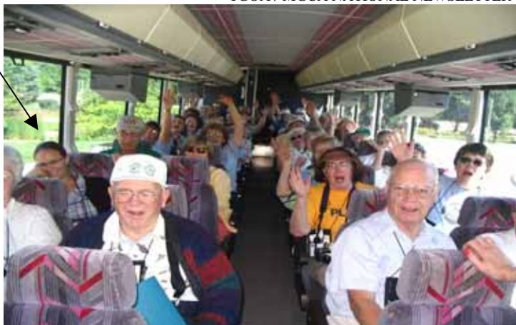
Friday afternoon, July 13, 2007. Bus tour to Rockford gardens