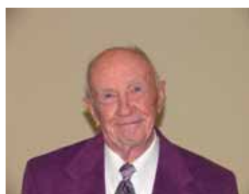
For the 2010 President Fellow Gardeners,

I trust that all who attended the TGOA/MGCA convention in Grand Rapids arrived home safely. Those who attended, drank lemonade, talked to old friends, made some new ones, learned some new gardening knowledge, and though the meeting ended too soon.