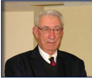
The 2011 President's Message