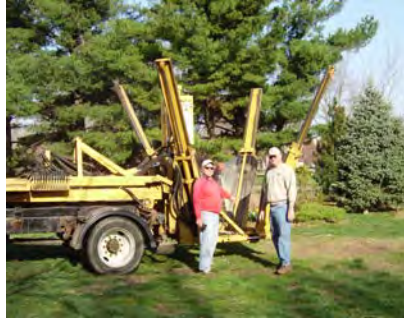
Getting ready to dig the hole for the Pin Oak

On the 1 st of April, three members of the B & G committee and I made a