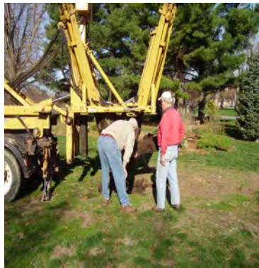
Digging the hole for the Pin Oak