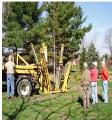
Planting the Pin Oak