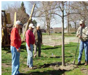
The supervisors checking the Pin Oak placement

trip to Indianola, Iowa to pick up a donation of 60 bags of cocoa bean hull mulch for the flower beds on the grounds. The Indianola Garden Club has been making this donation for more years than I can recall. Unfortunately the Indianola club disaffiliated from TGOA/MGCA five years ago, but fortunately for TGOA/MGCA, still continue to support the headquarter grounds from their annual fund raiser stock of cocoa bean hull mulch. The donation is greatly appreciated, and for a short time, once it is spread on the beds, the grounds have the smell of chocolate.