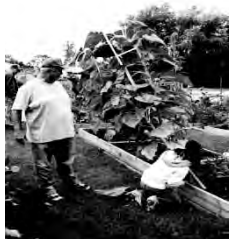
Youth Gardening Program MGC of Youngstown, OH